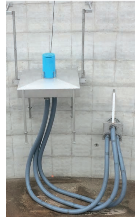
AQUADECANT® 2017 BOORTMALT