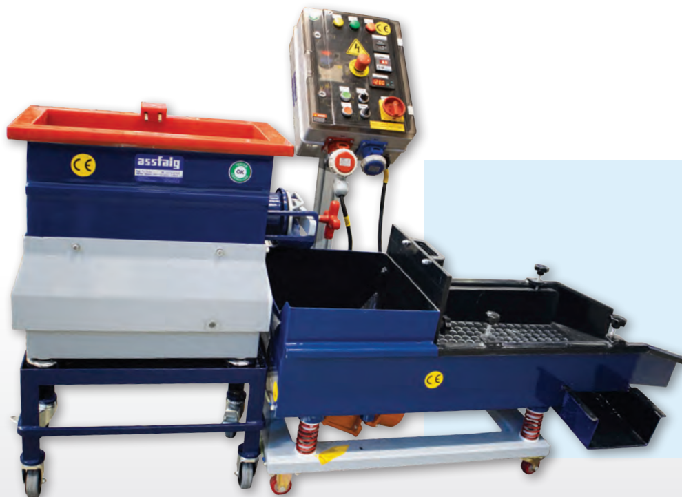
TV 15-SL with Separator