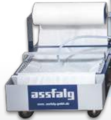
Paper filter PF440

Edges and surfaces of the most varied workpieces are machined unmanned. The larger the grinding wheel, the faster the deburring process.