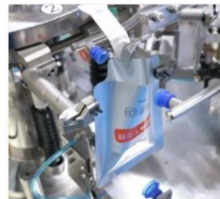
Pouch Opening Device