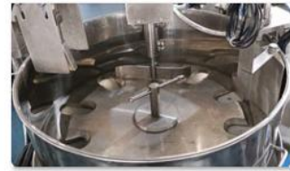
Filler and Measurement