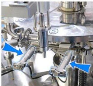
Pouch width Adjustment