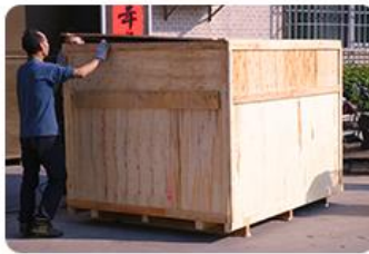
Pack in wooden case