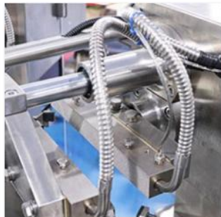
Pouch Sealing Device