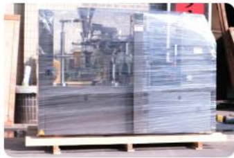
Clean and film up after adjustment