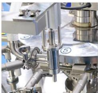
Rotary Operation Platform