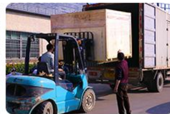
Loading and deliver