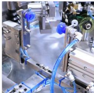
Pouch Suction Device