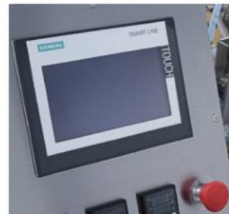
PLC Control System