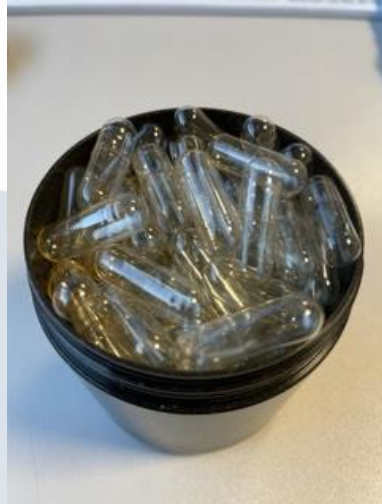
00 size x 120 capsules (100%)