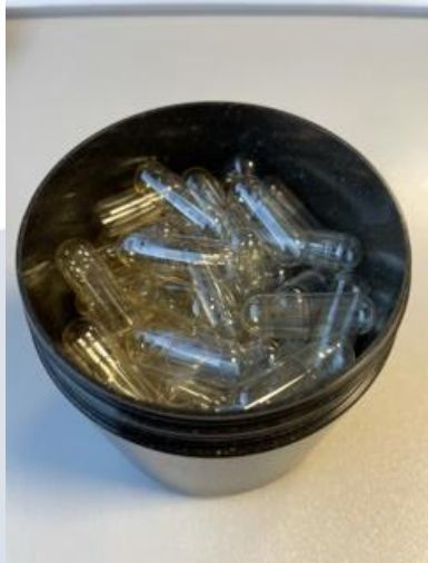
00 size x 90 capsules (80%)