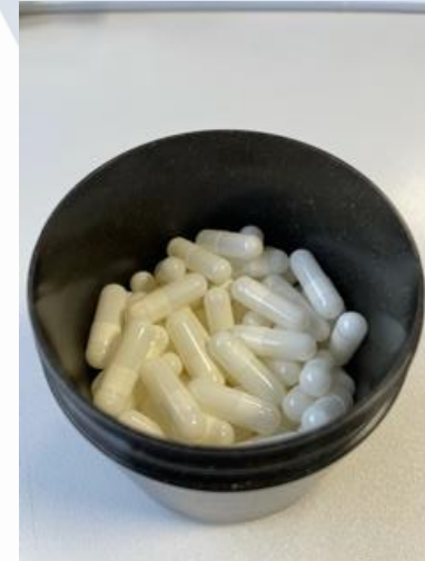
1 size x 90 capsules (60%)