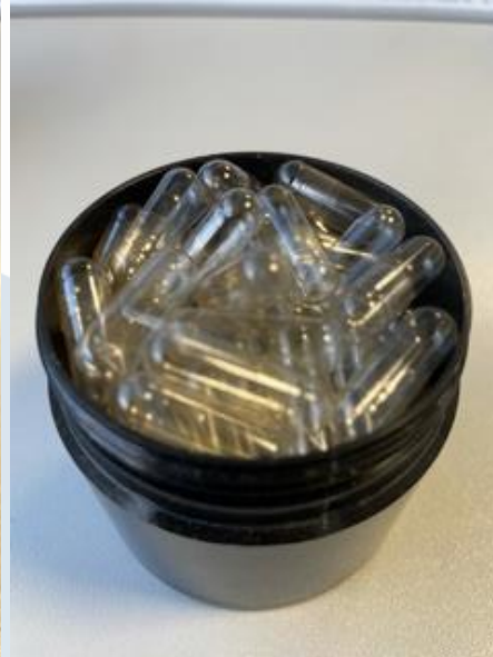
0 size x 90 capsules (95%)