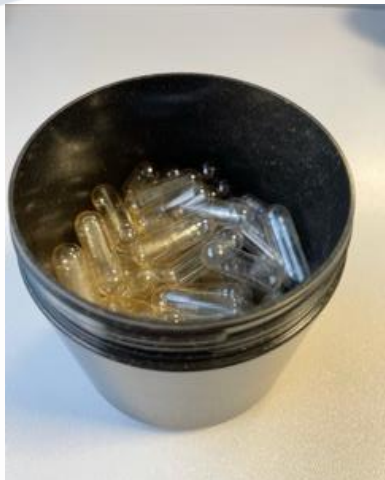
0 size x 90 capsules (65%)