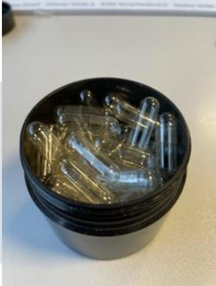
00 size x 60 capsules (85%)