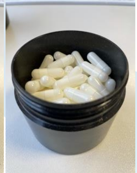
1 size x 90 capsules (80%)

*These pictures are for reference only. We recommend our customers to check the size of jars with their own product