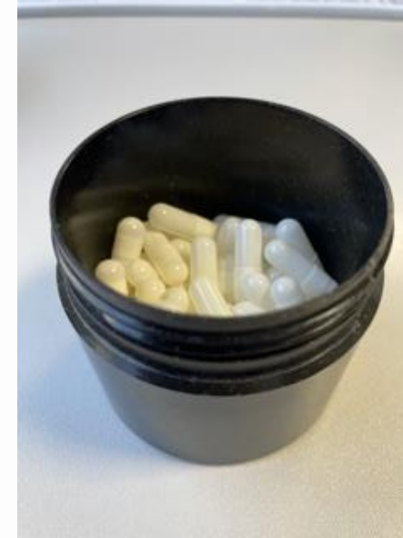
1 size x 60 capsules (50%)