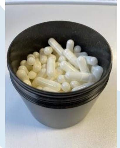
1 size x 120 capsules (80%)