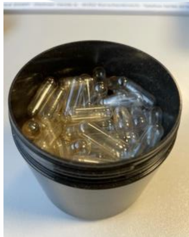
0 size x 120 capsules (85%)

*These pictures are for reference only. We recommend our customers to check the size of jars with their own product