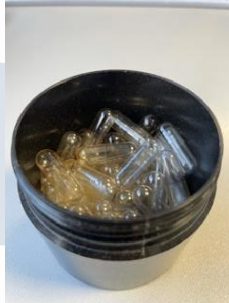
0 size x 60 capsules (65%)