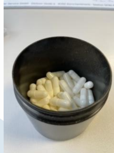
1 size x 60 capsules (40%)