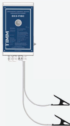
Monitoring of 1 big bag