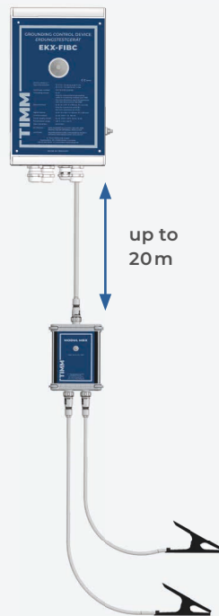
Monitoring of 1 big bag with remote LED indicator