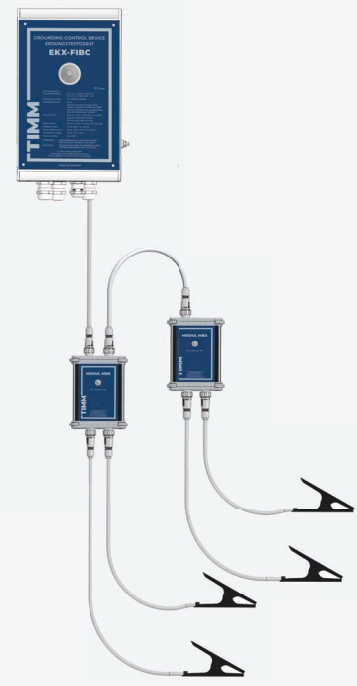
Simultaneous monitoring of 2 big bags

For further information and additional accessories, visit us at www.timm-technology.de/en/products/ekx-fibc or contact us.