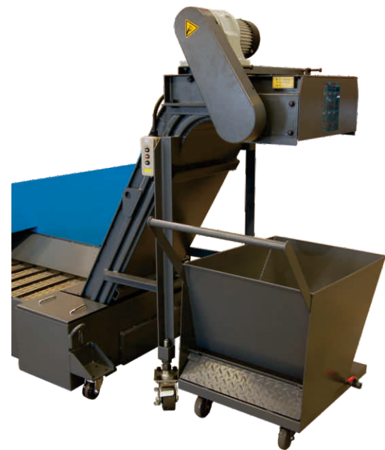
Electric chip conveyor with chip bucket