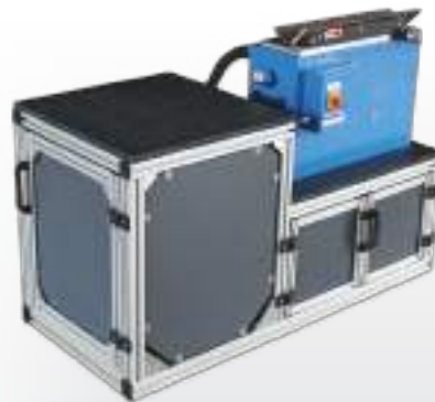
KSM 125 with undercarriage and integrated extractor