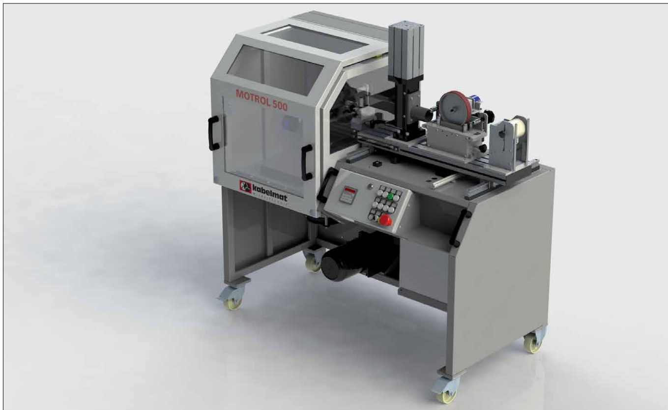
Fig. 1 MOTROL® 500