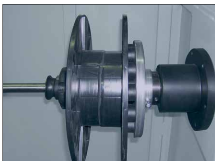
Fig. 3 Spool winding axle