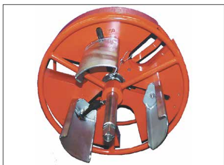
Fig. 2 Coil and spool dispensing unit RAPID 480 SL