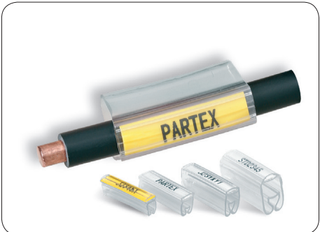
PFC-card PFC in PT+PFC sleeve