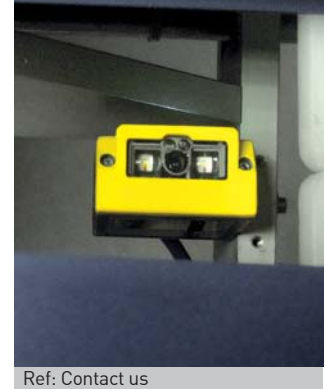
Ref: Contact us