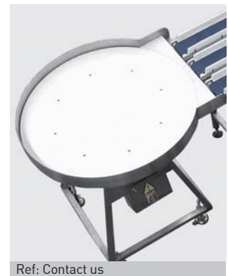
Ref: Contact us

Rollers conveyor for transporting or accumulating products.