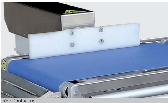
Ref: Contact us

To collect wrapped and/or labelled products.