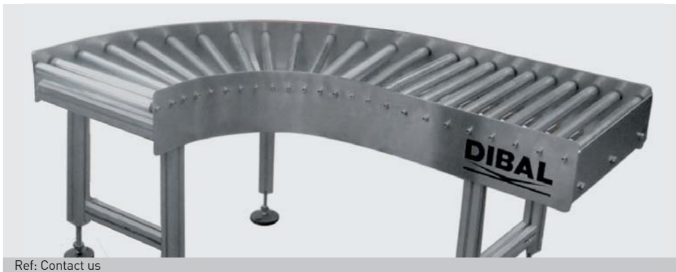
Ref: Contact us