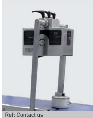
Ref: Contact us

Infeed/output conveyor L1,000 x W280 mm, with smooth belt.