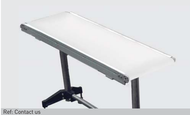
Ref: Contact us