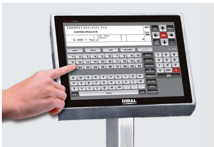
> Touch screen console