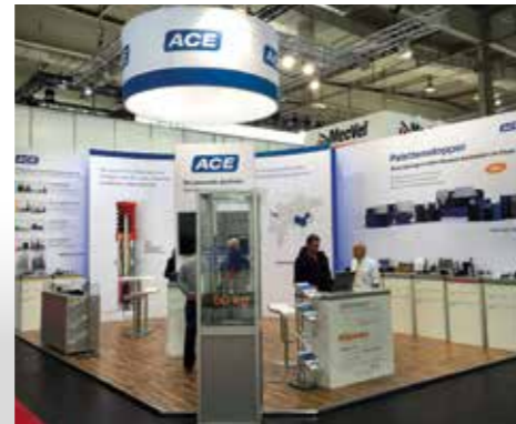
ACE booth – on our website you can find out at which trade fairs we are represented. We look forward to your visit.