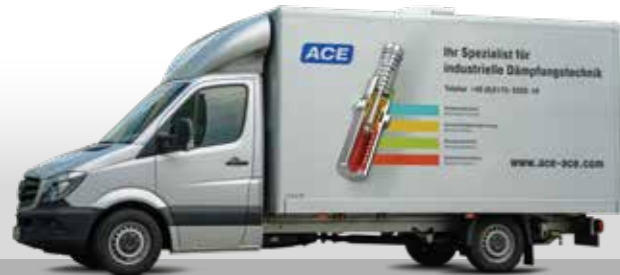
ACE demonstration vehicle – your free trainings on premises. We will give you a demonstration on your parking place, you supply a 230V power connection.