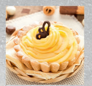
Table Margarine "For cakes" 80% was developed taking into account traditional requirements to production of finishing cream semi-finished products, soufflé. It is recommended to replace dairy butter in receipts of basic creams when developing own receipts. It possesses consistence and fat content of a dairy butter (spread) and can replace dairy butter (spread) in this product segment without loss of quality of the final product.