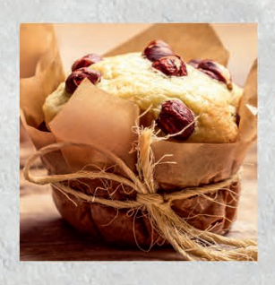
Table Margarine "Gourmet" 40%, Soft Margarine "Gourmet" 35% for the production of cheap flour confectionery products. It has a low fat content and high microbiological stability. It has along shelf life and is optimized for use in production of low-fat confectionery technologies. Uniformly distributed in the dough imparts color and flavor to the finished product. It increases the shelf life of the finished product.