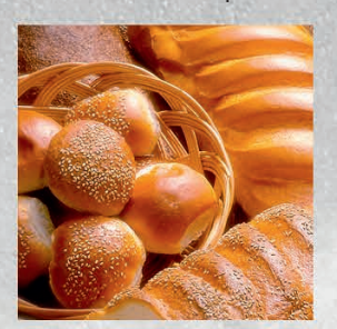
Table Margarine "Stolichnyi Special" 50%, Table Margarine "Stolichnyi Special" 60% shall be used for cooking culinary, flour confectionery and bakery in serial production and also for food consumption in public nutrition chains. Spreading evently in the dough it gives wonderful taste, ruddy colour and delicate flavor to finished bakery. It allows extending storage terms of finished product. It is recommended for production of low-fat pastries. Table margarine Table margarine