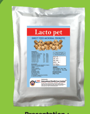
Presentation: 200 gm Pouch

Small breeds - 5 -10 g / day orally. Large breeds - 10 - 15 g / day orally. (or) as directed by a veterinarian.