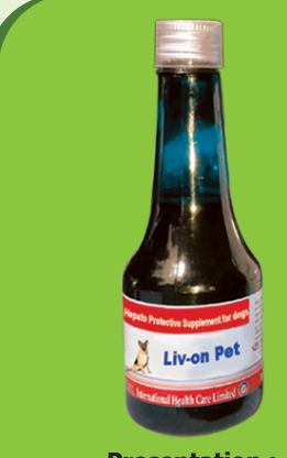
Presentation: 100 ml and 200 ml bottle

Puppies : 2.5 - 3 ml B.I.D orally. Adult dog: 5 ml B.I.D orally. (or) as directed by a veterinarian.