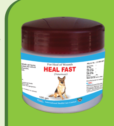
Presentation: 50 gm / 100 gm Tins