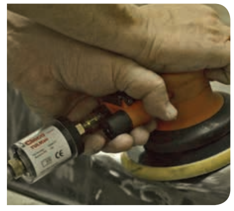
Run time monitoring for consumable use or process efficiency