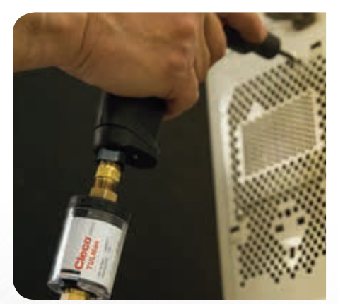
Cycle monitoring for calibration and service

Manages tool service, manage tool calibration, quantify and compare tool and consumable life, monitor workforce productivity, improve quality of product or process and realize cost savings