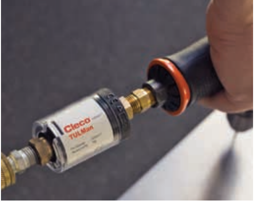
Run time monitoring for performance checking and service