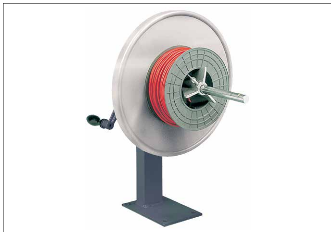
Fig. 1 TISCHROL Complete device