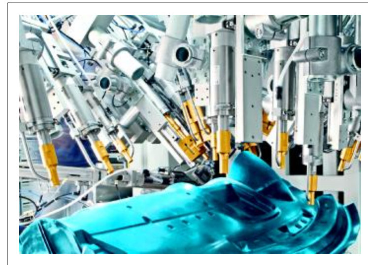
View into the interior of a special ultrasonic machine for the production of I-panels

The pneumatic feed units are fixed preferably in a flexible piping system. This allows the unrestricted adjustment of the welding positions in all directions. Like this parts modifications during the manufacturing phase can be taken into account without causing additional costs.