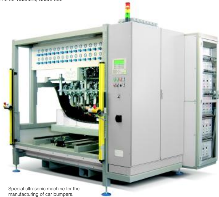
Special ultrasonic machine for the manufacturing of car bumpers.

for plastic parts in the automotive industry, for example column panelling with wrapping technique, I-panels, door panelling, centre consoles, spoilers, bumpers, coating with sound protection, cluster (instrument carriers) etc. Apart from this these machines are used also in other industry branches, like in the appliances industry for manufacturing of components for washers, driers etc.