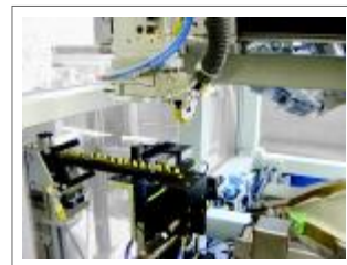
Feeding automation for the exact positioning of clips on interior trim parts of cars.

These machines can also be designed for complex problem solutions. They can also be combined, for example, with other welding techniques, like vibration, hot plate etc. and with a wide variety of automation possibilities. These include the feeding technology of clips and also other techniques like imprinting and embossing, bar code systems or other automatic loading systems as a part of the quality control and a complete recording. The individual components are largely standardized.