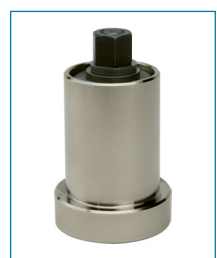
Compatible: Joint simulator (Female Joint-Kits)