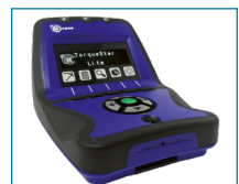
Compatible: data collector TorqueStar Lite