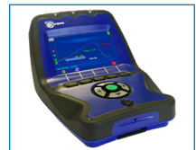
Compatible: data collector TorqueStar Plus/Pro