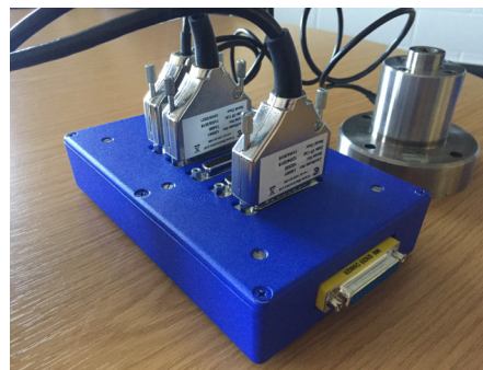
Optional auto transducer switch: 5-way sensor switch for Crane ‚UTA‘ or ‚Multi‘ sensors. An LED indicates the currently active transducer. The connected Crane measuring device suggests the most suitable sensor in the display.

Stationary torque transducers combine compact dimensions, low weight and superior quality. The UTA version has an integrated smart chip on which the torque range, serial number, calibration date, bridge resistance and sensitivity are stored. This means that the UTA transducers work „plug & play“ with Crane's readout devices, e.g. TorqueStar, IQVu or ReadStar II. Automatic recognition avoids possible setup errors and shortens set-up times.