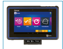
Compatible: data collector IQVu (Plus)