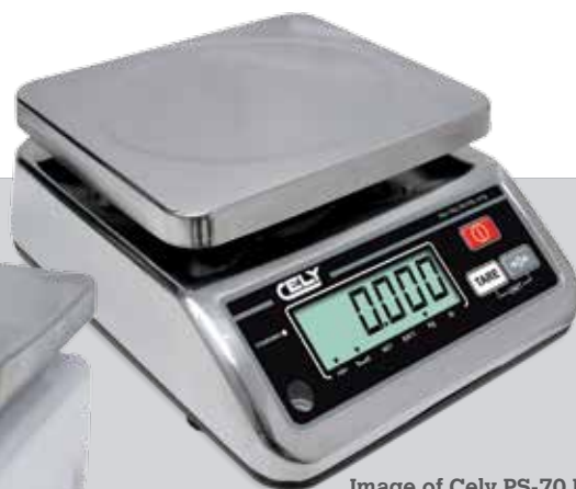
Image of Cely PS-70 I