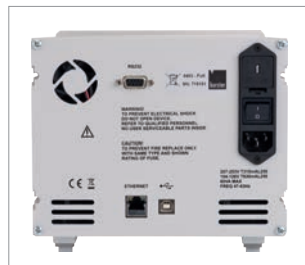
Rückseite mit Anschlüssen