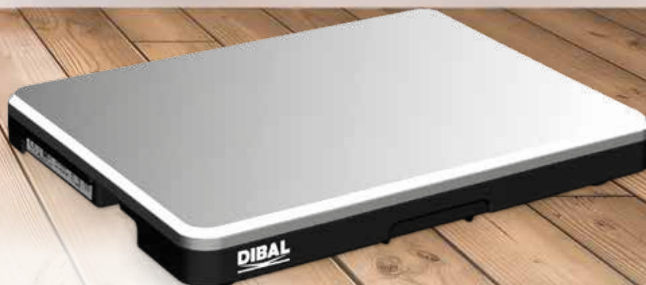
Dimensions DATA IN mm