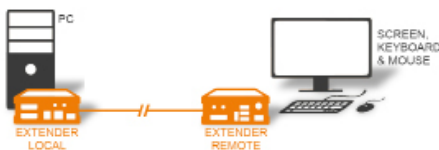
POINT TO POINT CONNECTION

point to point max. distance 150m/492ft in copper