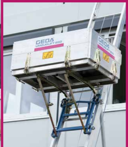
With rigid platform