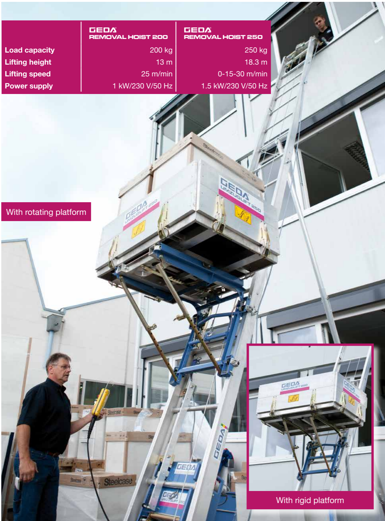
With rotating platform