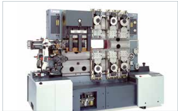
Multicenter MC 82