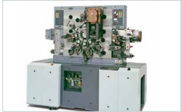
Multicenter MC 42