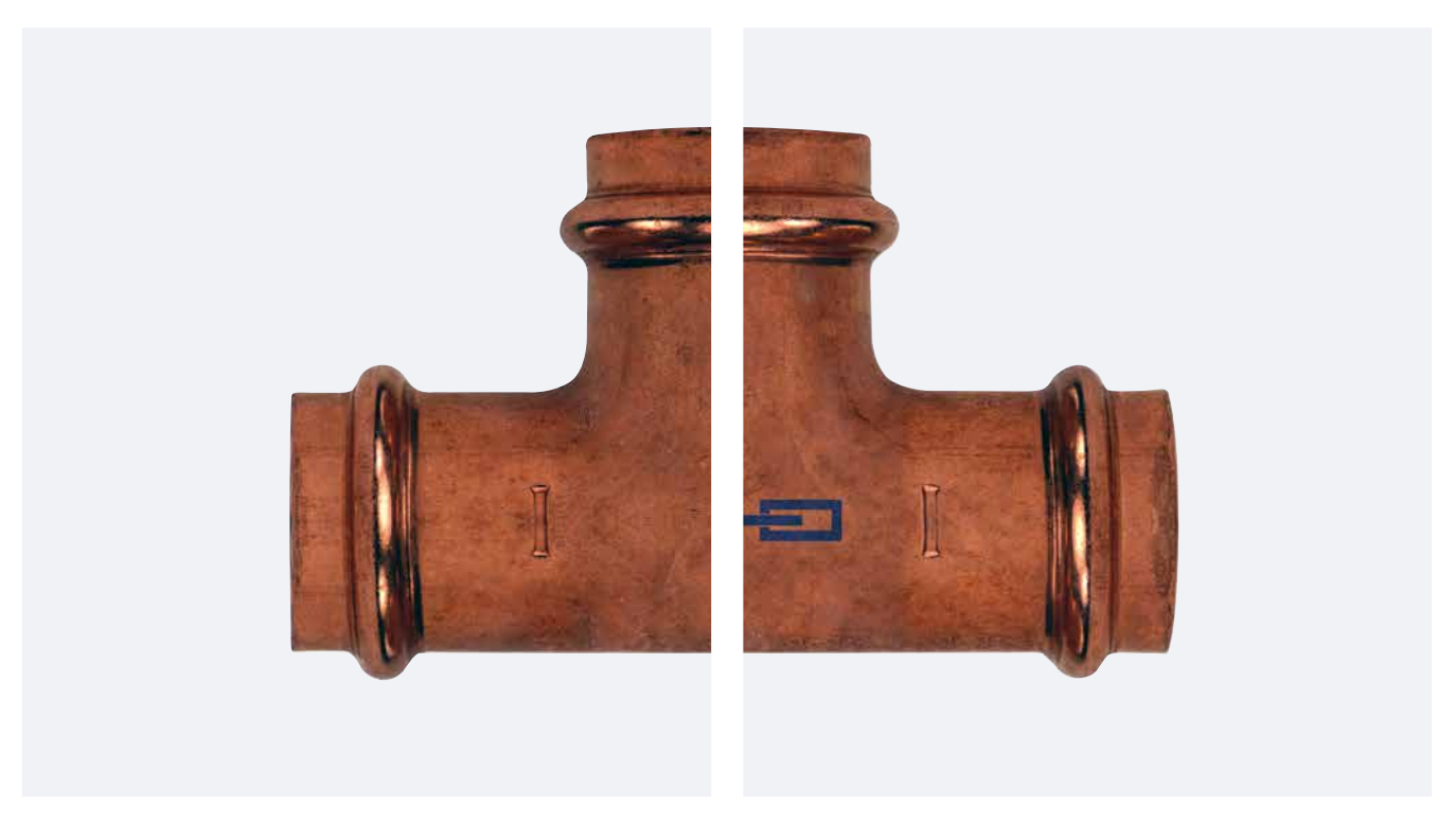
With pad printing it becomes recognizable.