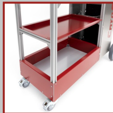
Storage for hoses and accessories