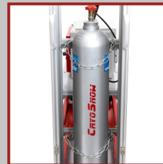
Fixing of CO2 cylinder