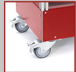
Steering wheels with locking brake