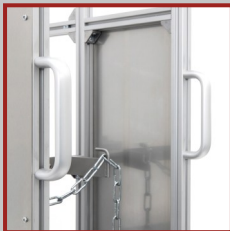
Ergonomic driving handles