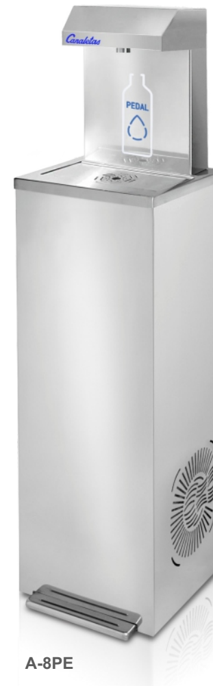
A-8PE Pedal: cold water