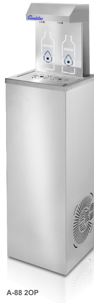
A-88 20P Sensor: cold water Sensor: room temperature water