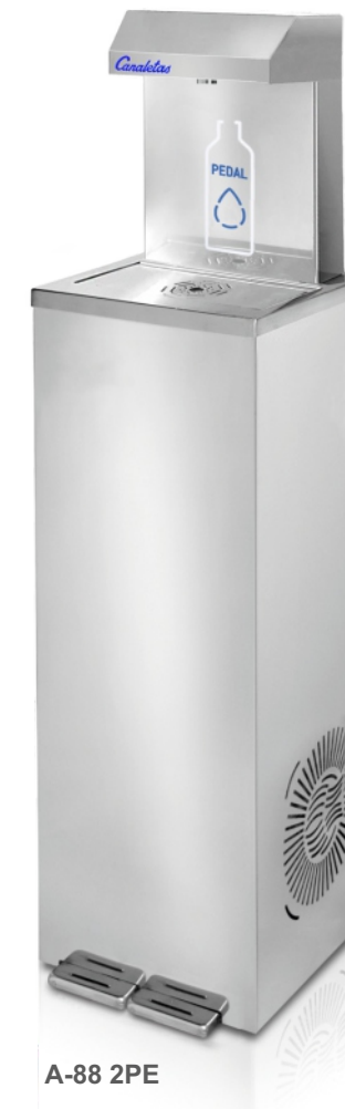
A-88 2PE Pedal: cold water Pedal: room temperature water Both pedals simultaneously: mixed water