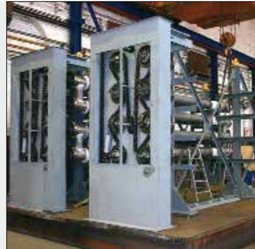
Scraped surface exchanger in our works