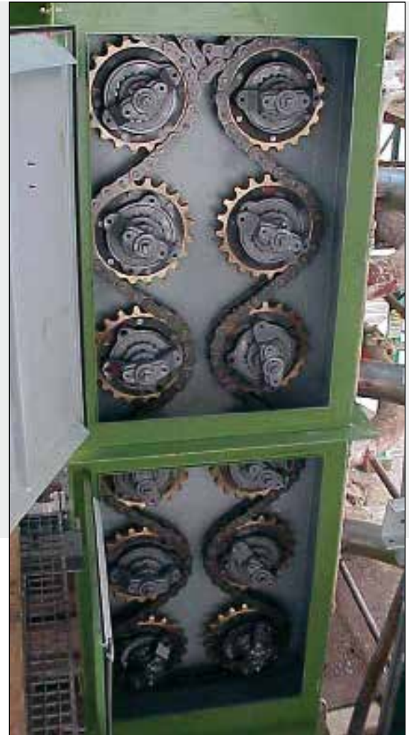
Replacement drive system

BORSIG can solve these problems by supplying complete drive systems including new scraper shafts which fit exactly into existing scraped surface exchangers of various manufacturers thus adapting them to the BORSIG design. With this adaption to our well proven and patented drive and scraper shaft system our customer will be capable of considerably improving the mechanically reliability as well as reducing the maintenance costs.