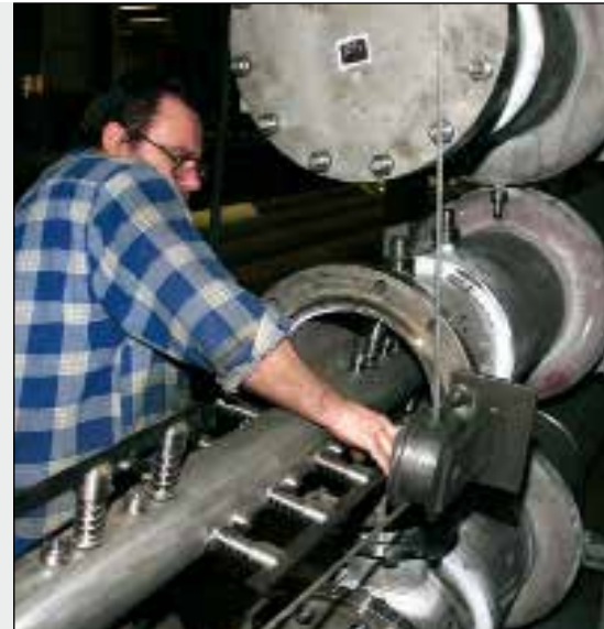
Installation of scraper shaft