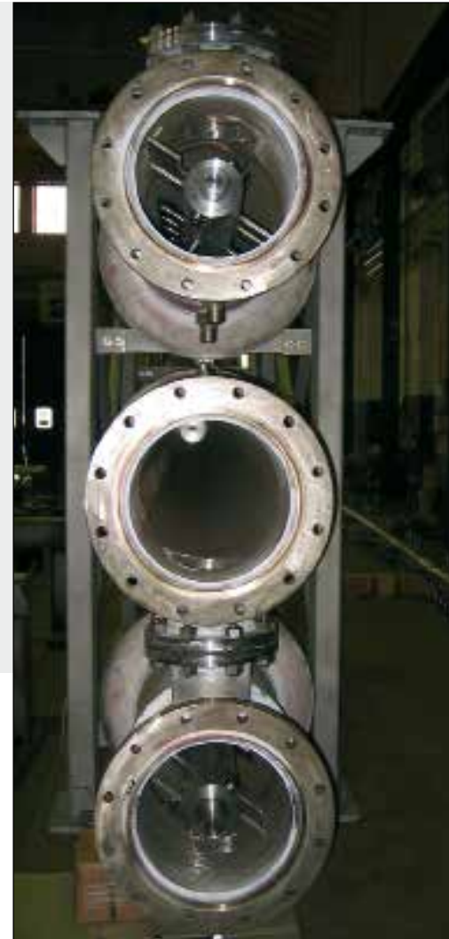
Installed scraper shaft