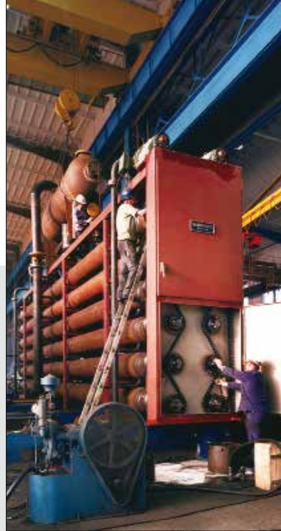
BORSIG scraped surface exchanger in the workshop

We supply scraped surface exchangers for each required volume flow and thermal capacity of inner pipe dimensions of 6 inch, 8 inch, 10 inch, 12 inch and any other special size, which might be required.