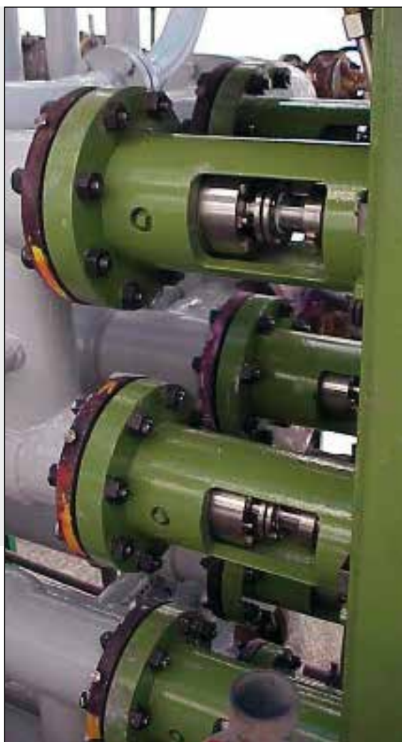
Mechanical seals in replacement drive system

After changing over to this modern and updated design the existing scraped surface exchangers will give guaranteed troublefree operation for a long time.