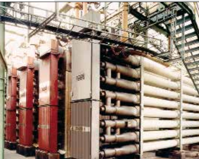
Scraped surface exchanger at plant site