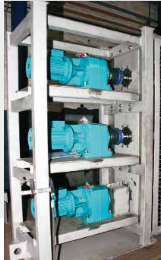
Gear motors for drive system

The instructions required for proper installation, startup, servicing and maintenance are set forth in an operating manual which will be supplied for each scraped surface exchanger.