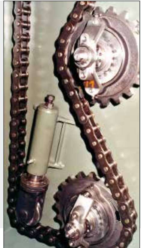
Sprocket wheels, chain, tensioner

The BORSIG drive unit meets these requirements in an excellent way with regard to quick and easy maintenance.