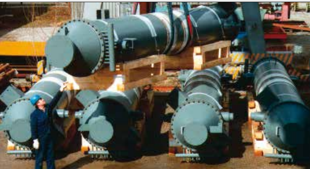
BORSIG tunnellflow quencher (TLE) for ethylene cracking furnaces