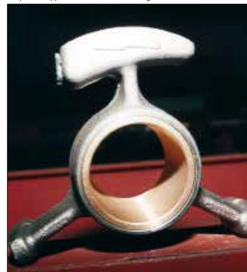
Spider support for lube oil dewaxing service