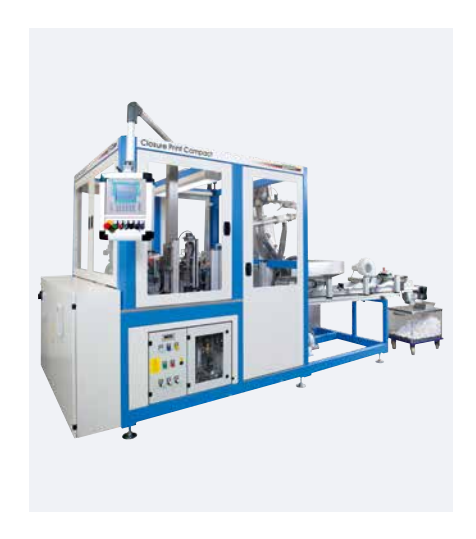
CLOSURE PRINT COMPACT