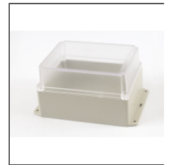
Some models supplied with deep lids.