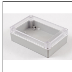
Clear Lid (polycarbonate version shown)