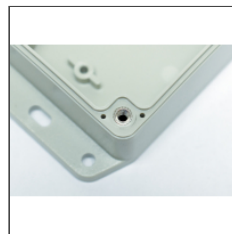
Features corrosion resistant inserts for lid assembly