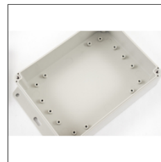
Internal mounting points for PC boards or panels