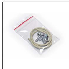
Hardware includes lid screws, PC board screws, and gasket