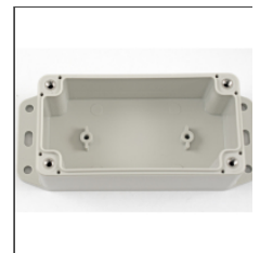
Internal DIN rail mounting point.