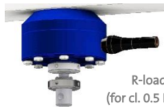
R-load cell (for cl. 0.5 ISO 7500)