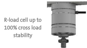
R-load cell up to 100% cross load stability