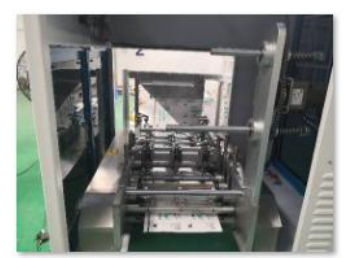
Seaing and cutter