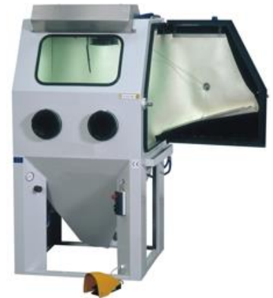
example AQUA BLAST 915

The AQUA BLAST wet blasting cabinet is a combination system for degreasing and simultaneous gentle beams of various workpieces. The water - jet mixture is housed in the cabin sump. This abrasive mixture is sucked in via a novel centrifugal pump of wear-resistant polyurethane. At the jet of compressed air is additionally adjustable added so as to achieve an optimum surface finish. After loading of the workpiece, the blasting medium mixture flows back into the cabin sump and is thus an abrasive circuit ensured. Battered fine abrasive is suspended from the cab sump and fed to a band filter on the cabin back.