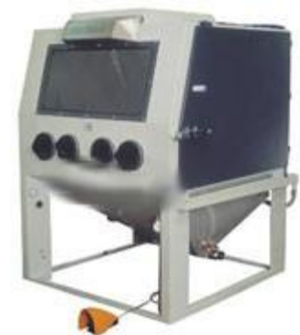
example AQUA BLAST