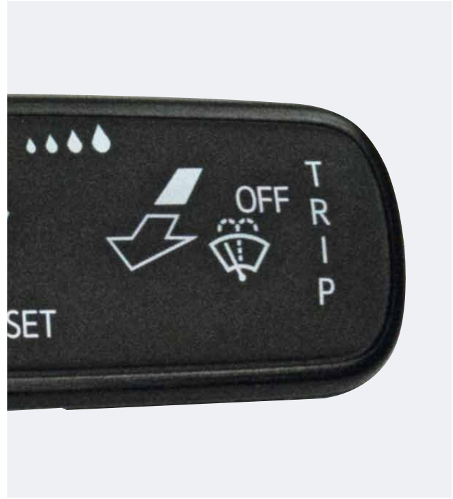
With pad printing, it is switchable