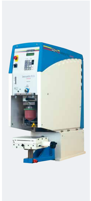
HERMETIC 9-12 universal