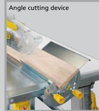
Angle cutting device

Seria ZBV with adjustable cutting height and transport wheels