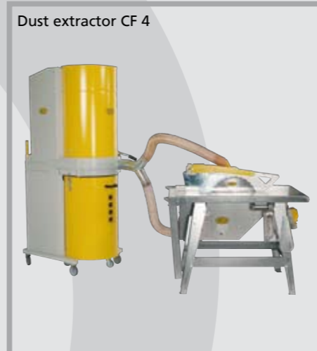
Dust extractor CF 4