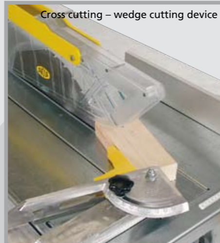
Cross cutting – wedge cutting device