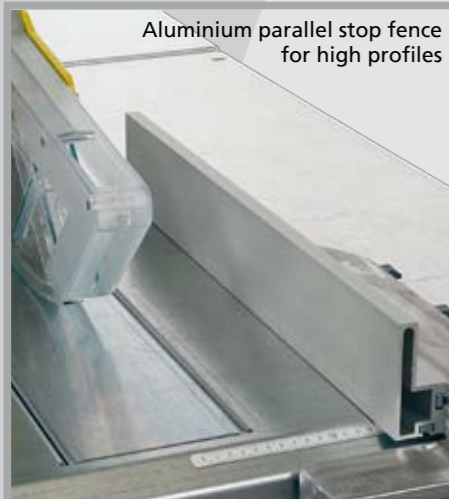
Aluminium parallel stop fence for high profiles