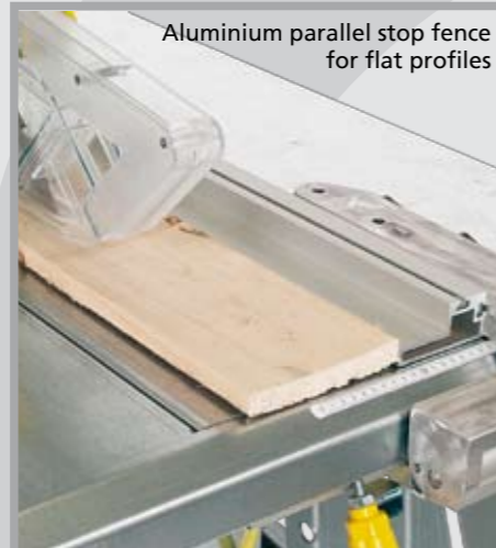
Aluminium parallel stop fence for flat profiles