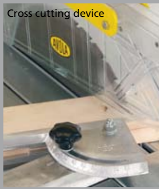
Cross cutting device