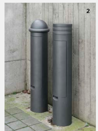
2 FEEDER-BOLLARD 300-1/ FEEDER-BOLLARD 300-2 Mersch Luxembourg