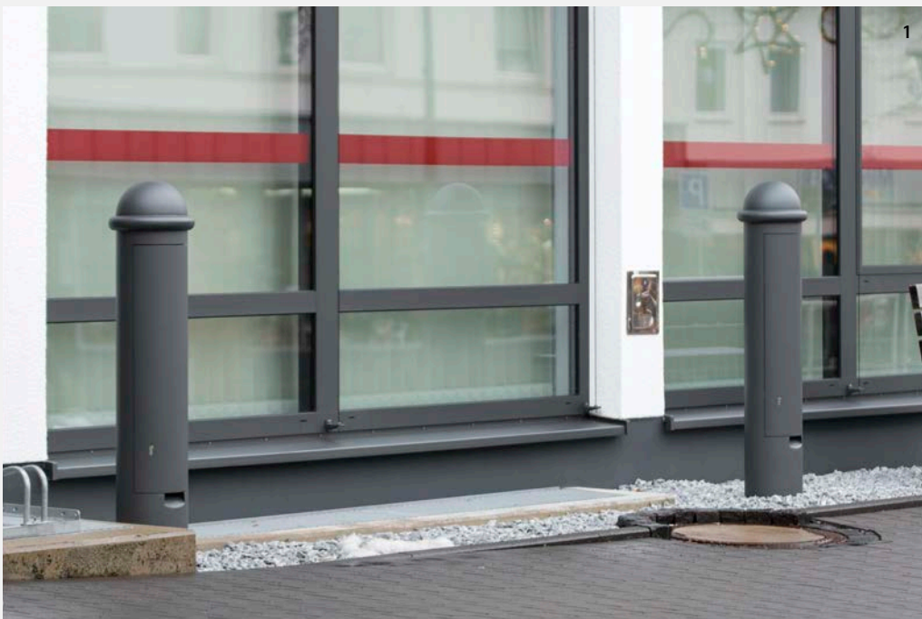
1 FEEDER-BOLLARD 300-2 Daun Germany