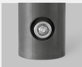
The only bollard ashtray with predetermined breaking point