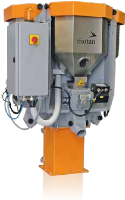
SPECTROCOLOR V with 10L collecting bin and three dosing modules