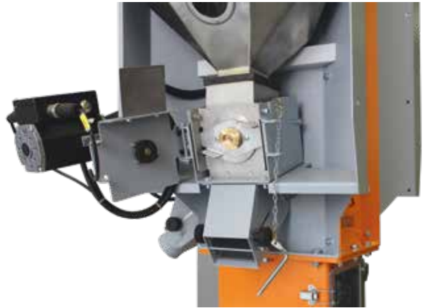
One-sided bearing mounted dosing screw with quick release connection