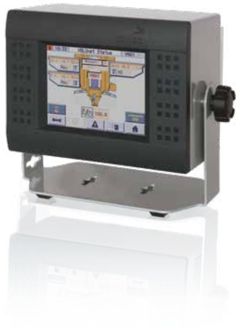
VOLUnet SC control

motan's unique gravity-mixing principle offers a high level of mix consistency of the components before they reach the extruder. This plays a key role in achieving perfect plasticisation and homogenisation of the materials.