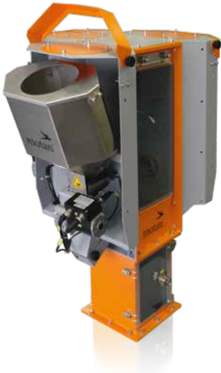
Quick change system