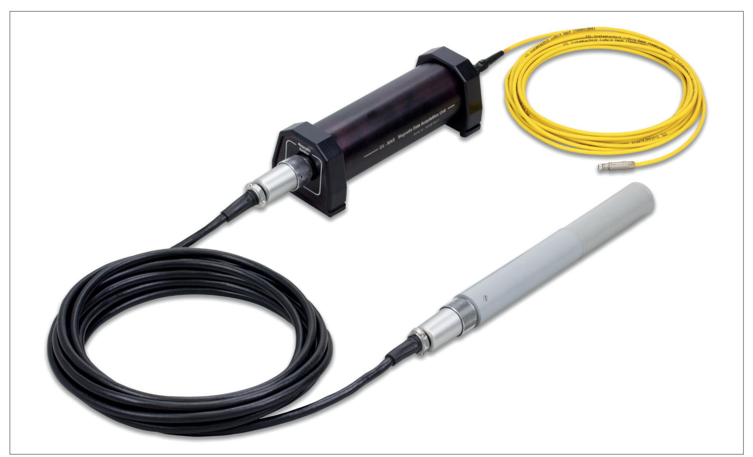
DM-005 with coaxial cable (included)