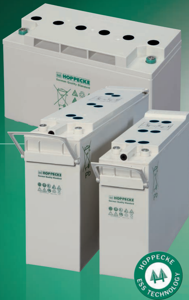
Similar to the illustration