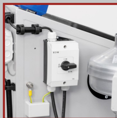
Main switch for exhaust air system and lighting