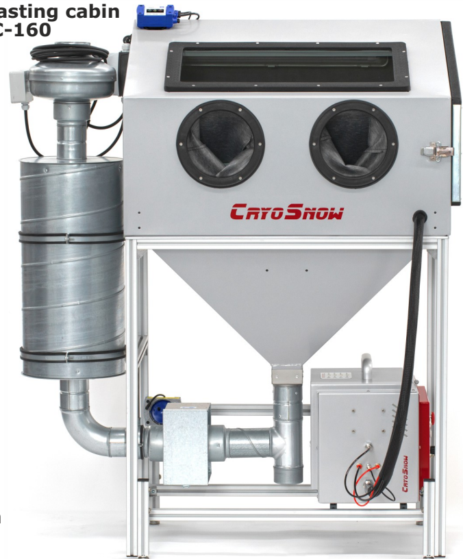
Blasting cabin BC-160