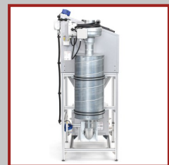
Exhaust system with filter, silencer and fan