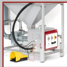
Control unit attached to the frame to save space