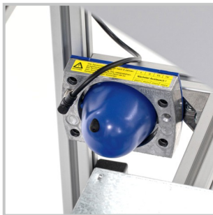
CO2 sensor is mounted on the frame in case of installing a measuring- and warning system