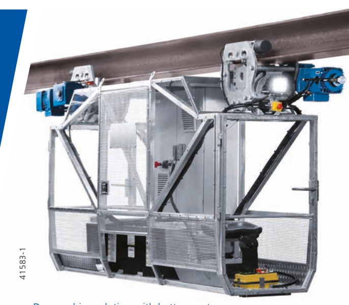
Demag drive solution with battery system: transported on rails for bridge inspection work