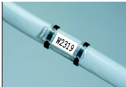
PM-sleeve with a label from a PF-sheet