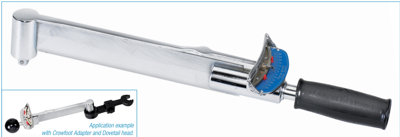
Application example with Crowfoot Adapter and Dovetail head.