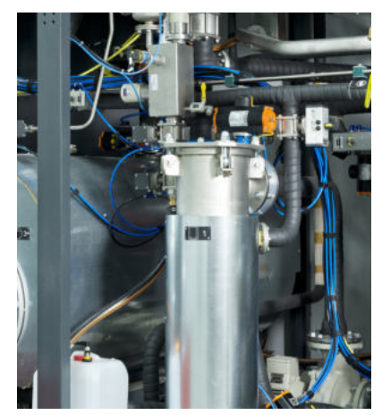
Filter monitoring and drying