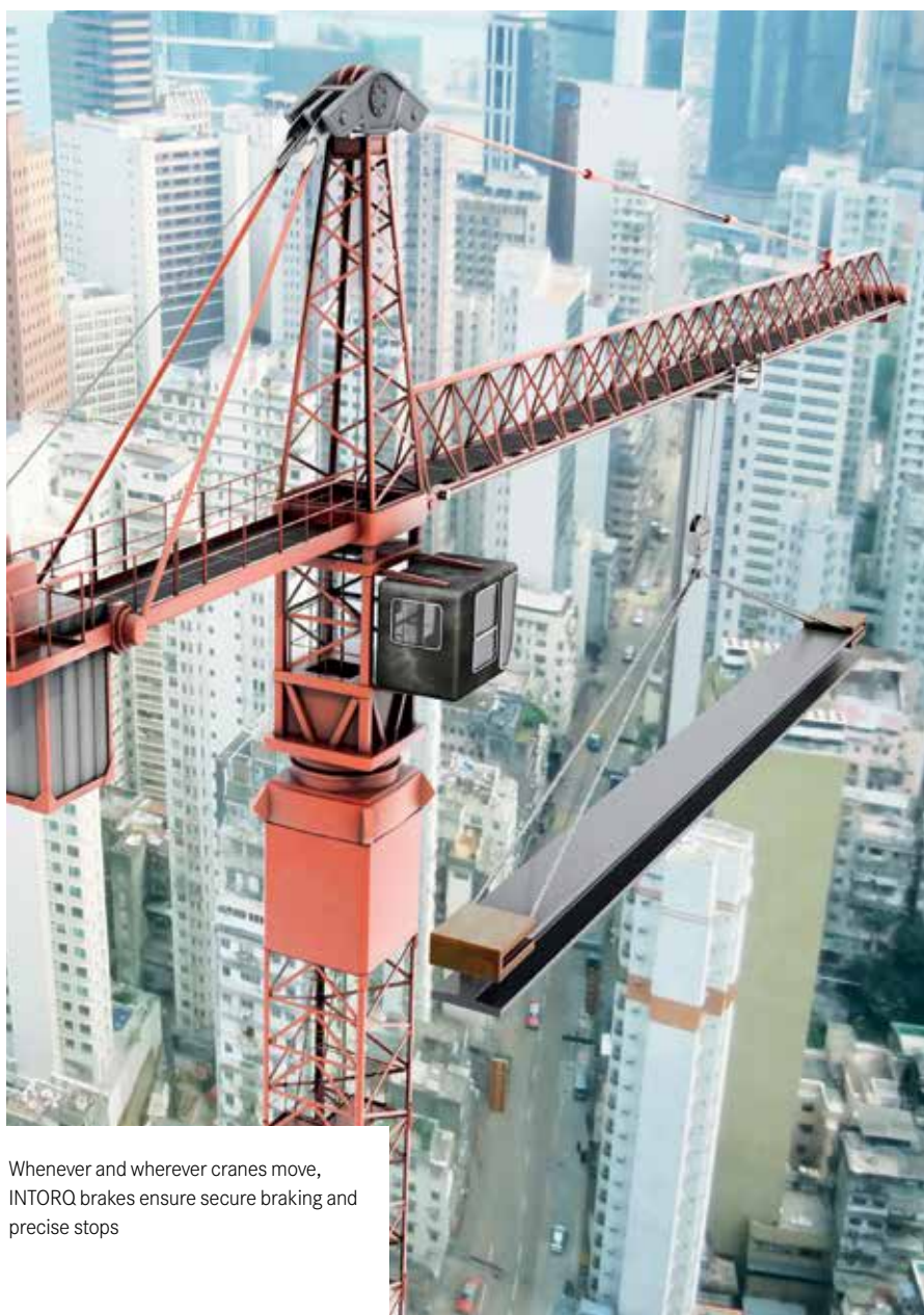
Whenever and wherever cranes move, INTORQ brakes ensure secure braking and precise stops