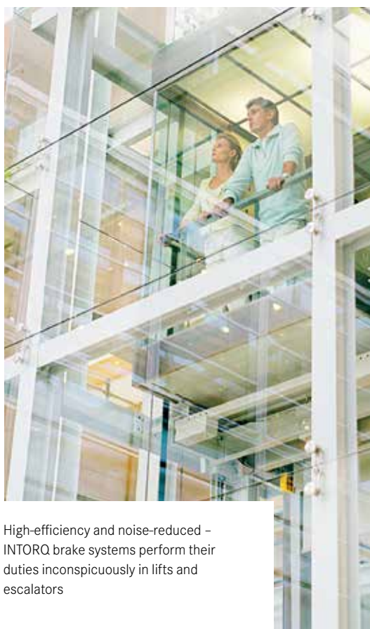
High-efficiency and noise-reduced – INTORQ brake systems perform their duties inconspicuously in lifts and escalators