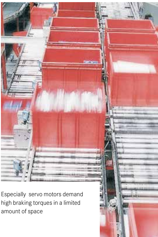
Especially servo motors demand high braking torques in a limited amount of space