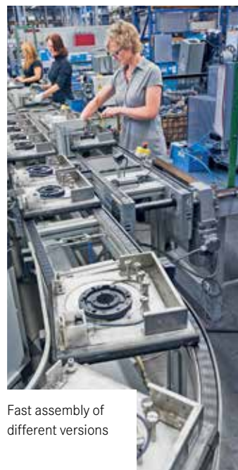
Fast assembly of different versions