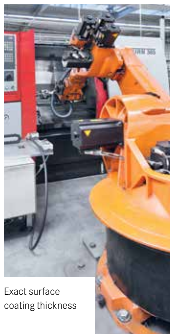
Exact surface coating thickness