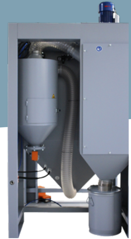
▼ Injector blast principle