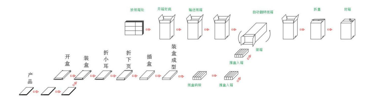
Case Erector Line Details