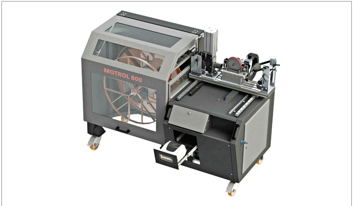
Fig. 1 MOTROL® 800