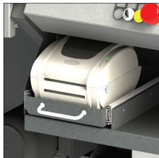
Fig. 4 Label printer