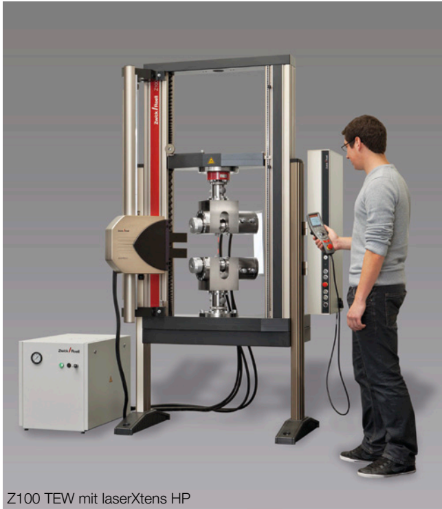
Z100 TEW mit laserXtens HP

Table-top machines Z030 up to Z100 of the AllroundLine